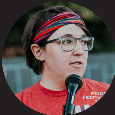
SMASH CARE Organizer She, Her, Hers